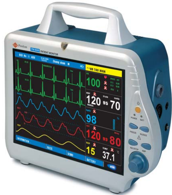
PM-8000 Portable Patient Monitor