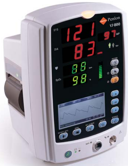
VS-800 Vital Signs Monitor