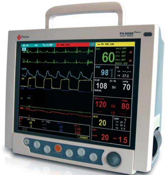
PM-9000 Express Portable Patient Monitor